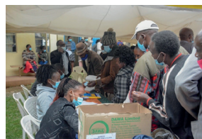
Meru residents register for the medical camp